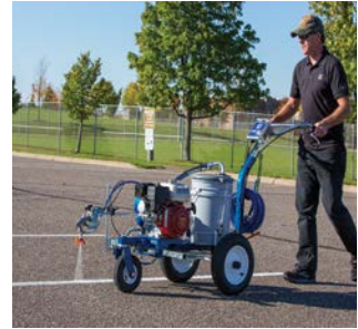
Front Swivel Wheel